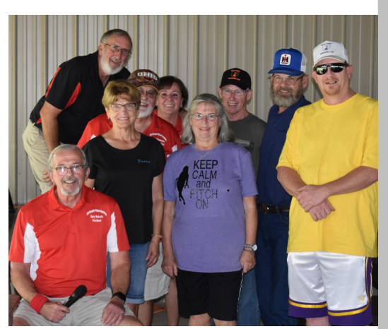
<u>Club of the Year</u> Ross County Horseshoe Club, Chillicothe