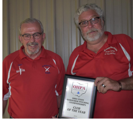
Club of the Year Darke County Horseshoe Club, Greenville