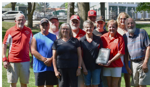
Club of the Year Ross County Horseshoe Club, Chillicothe